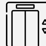
Vertical Transport Device Cleaning