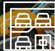
Car Dealership Groups