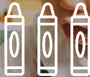
Day Care Centres