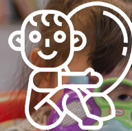
Early Education Centres