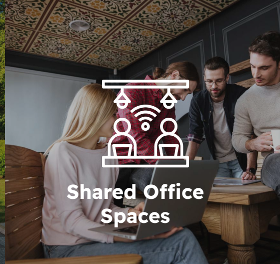
Shared Office Spaces