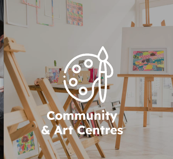
Community & Art Centres