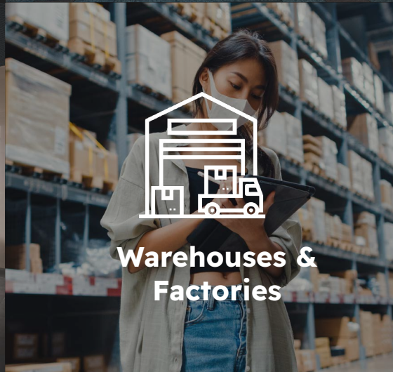
Warehouses & Factories