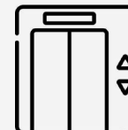
Vertical Transport Device Cleaning