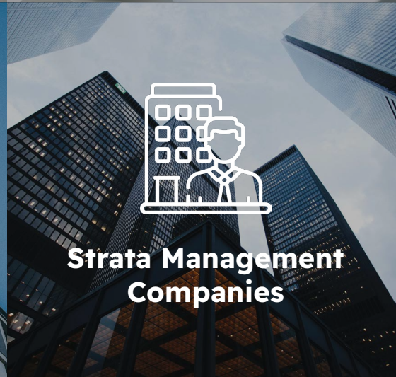
Strata Management Companies