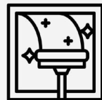
Full Window Cleaning