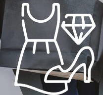
Fashion Store Franchises