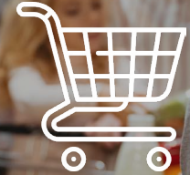
Retail & Service Franchises