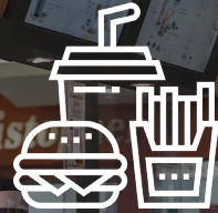
Franchised Food Groups