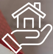
Loans & Mortgage Brokering Chains