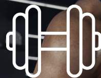
Gyms & Fitness Franchises