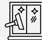
High Rise Window Cleaning