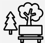
Public Area Cleaning and Maintenance