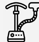
Carpet Steam Cleaning