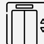
Vertical Transport Device Cleaning