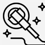
Floor Strip and Sealing