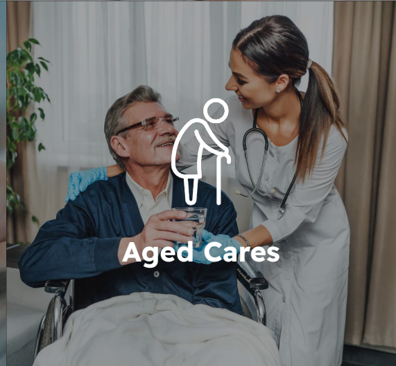
Aged Cares Clinics